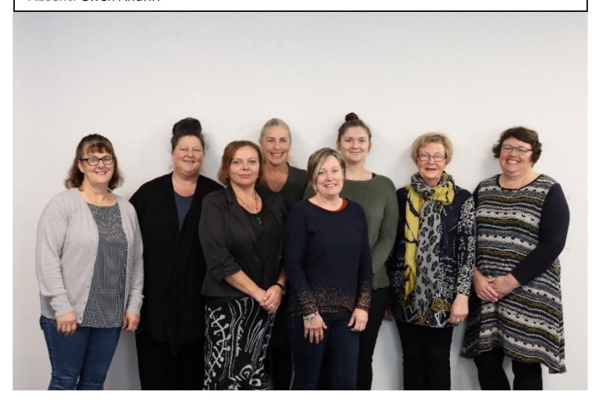
August 2021 Committee meeting